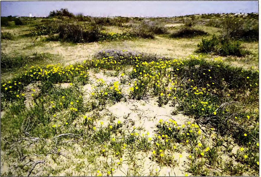
Fig. 2. Locality for B. exilis, 3 km west of Al Qatif, eastern Saudi Arabia.